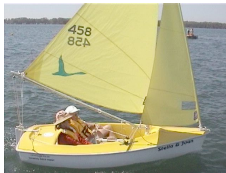
A Day on the Water

We would also welcome suggestions as to how we could improve and use this publication. Can anyone suggest a better name for than the one we have chosen?