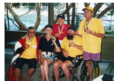
Some Recent Medal Winners